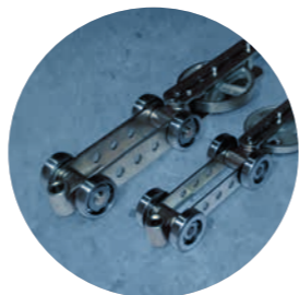
BI PLANAR CHAIN