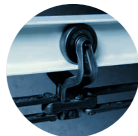
DROP FORGED RIVETLESS CHAIN