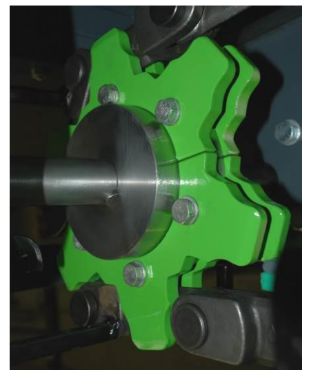
2-Drive wheel segments for forked chains